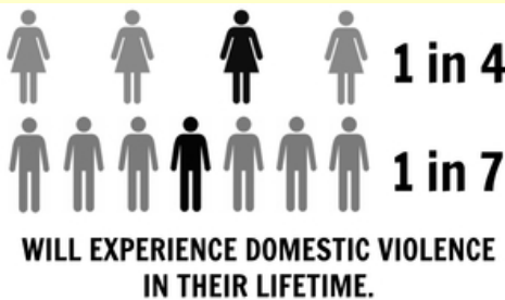
Emergency Shelter Programs

To find out more information about services call 352-686-8430 anytime (24/7)! To make an outreach appointment call (352)592-1288 during traditional business hours.